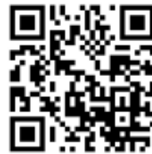
Figure 1- Utah Gun Safe Storage Video